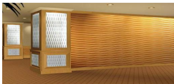
PICTURE SAMPLE OF PROPERLY INSTALLED PANEL

When the panels properly aligned, once they are filled with on the edges, sanded, primed and painted, the seam should not be visible like the picture below that shows three panels side by side.